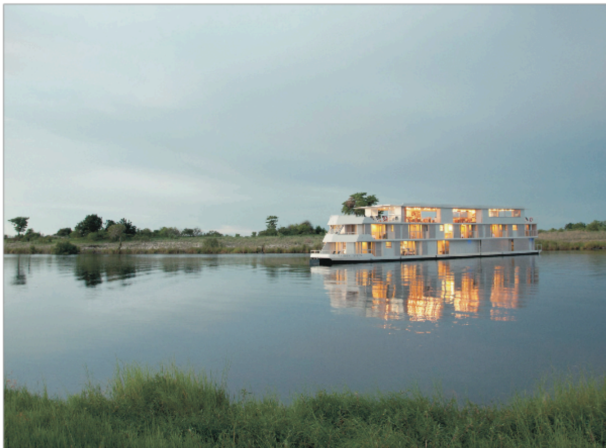
LAP OF LUXURY: You can lie on your bed in your cabin and watch the panorama unfold

Each morning and evening, unless you want to laze in your cabin or on deck, you can hop on to a small boat and explore the waterways. These cruises in the small boats enable you get so close to crocodiles that you can look into their beady eyes or study the skin colours that differ between individuals. You can observe the ominously large canines of hippo as they display their teeth to ward off other males. The joy of being a